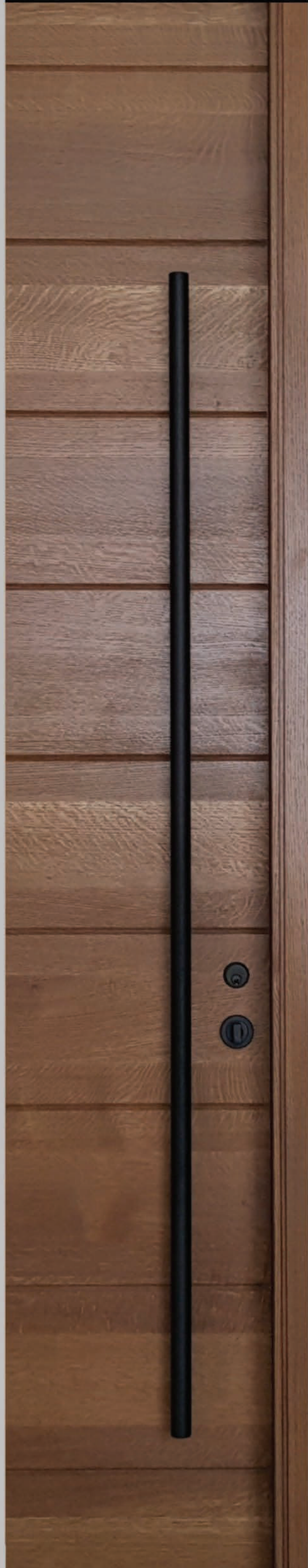
METRO PULL Lengths 24" - 48" - 72"